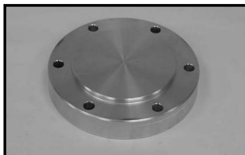
9804 (2) / 1" CV axle spacer